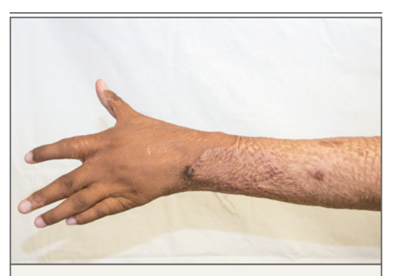
Figure 4. Sheet Skin Grafts and Meshed Grafts on a Patient's Hand and Arm.

Sheet skin grafts, shown on the patient's hand, are not meshed and have a much more natural appearance than meshed grafts, shown on the arm.